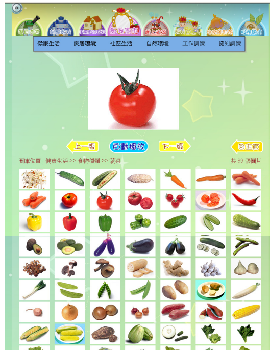
Photographs of daily objects inside “Photo Library”

People with autism have impairments in communication and social interaction, but they are strong in capturing visual images. If they have difficulties to deliver both verbal and written messages to recipients, visual communication such as photographs or pictures are suitable media to convey their ideas. Communication book is common tool for people with autism to convey messages to other people. Users can point out photographs and words in communication book to express their needs and ideas. One of main services in C-Rehab - “Photo Library” consists of clear and colorful photographs in area of food, beverages, clothing, public transport, and cooking utensils etc. Teachers or parents can download the photographs freely and design their own communication book.