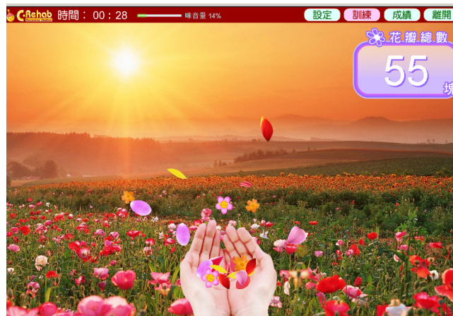
Exercise blowing in a simulated environment in C-Rehab

People with mild intellectual disability or physical disability may have oral motor delay. Oral motor delay may affect one’s oral motor control, chewing, speaking or language development, hence oral motor training is needed. Blowing exercise is an useful oral motor training. It can be in form of playing woodwind and brass instruments, singing, blowing paper boat, or blowing bubbles. Besides, computer equips with a microphone and suitable training program can also provide interactive blowing exercises. C-Rehab has designed several training programs to train blowing. The activities include blowing bubble, petal, dandelion, or acting as wolf in the story “Three Pigs and the Wolf”. Progress record and reusability are the major advantages of computerized oral motor training.