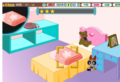
Scanning function inside C-Rehab's training program