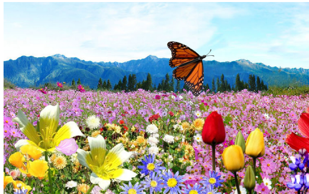
Interactive sensory stimulation training program to smooth emotion

People with severe intellectual disability cannot meet normal intellectual development markedly including the aspect in speech development. Even though they have own feelings and emotion, they have difficulties to express them verbally. Self stimulating or self injury behavior may happen to fulfill their emotional or sensory needs. C-Rehab consists of a series of interactive sensory stimulation training programs, which can facilitate them to express by pressing one switch only and passively receive visual and auditory stimulation. The ultimate goal is to prevent self injury behavior. Different topics are provided to suit various needs and interests, for example, flower garden, ocean, forest and Hong Kong scenery.